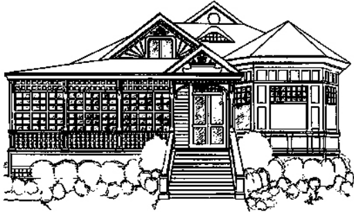
HERITAGE SQUARE HALL (CHURCH)