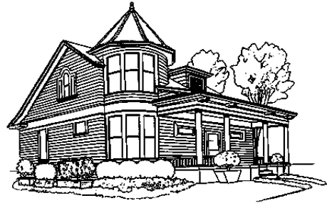
AUNT NETT'S HOUSE